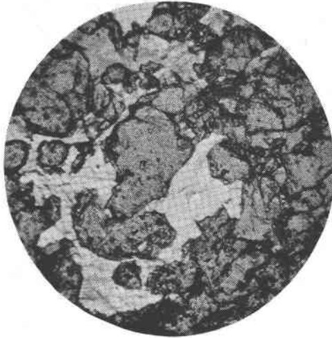
FIG. 3. Section of a garnet-rich veinlet showing later quartz and calcite. Cornucopia, Oregon. 35 \times .

Structures similar to those of the quartz-diopside veinlets prevail. There are, however, some minor differences such as a coarser central band of diopside in the midst of the quartz and garnet of the middle zone. Another feature peculiar to the garnet veins is a small but definite band of kaolinitic material along the outer margin of the transition zone and the country rock. It persists as an irregular band of fine, cloudy material averaging 0.15 mm. in width wherever the veinlets traverse the basic lavas. It is lacking where they traverse the schist. Another noteworthy feature is the presence of chlorite and pyrite commonly occurring in the upper reaches of the veins several hundred feet above the actual granodiorite contact.