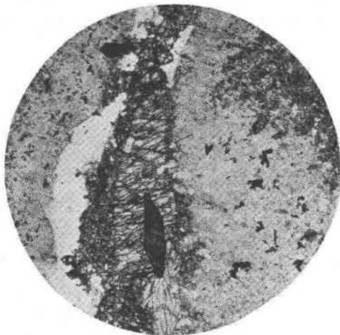
FIG. 2. A section showing the coarsely crystalline middle zone of clear quartz and dark, euhedral titanite surrounded by diopside. The same minerals appear on the margins of the middle zone but of considerably smaller dimensions. Snoqualmie Pass, Washington. 12X.

Where the quartz-diopside veinlets traverse these metamorphosed basic lavas their mineral composition is radically changed. Calcite appears as a late mineral. Garnet becomes noticeable, and in some veinlets may exceed 50 per cent of the mineral composition. With this increase in garnet there is a corresponding decrease in diopside and titanite. The amount of quartz varies from 0-50 per