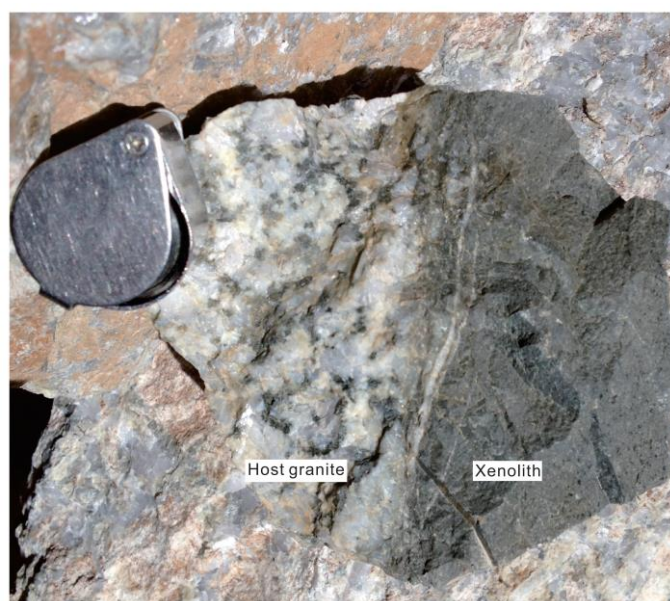
Figure S2 Photograph of the Zhazhalong amphibole-rich xenoliths in hand specimen.